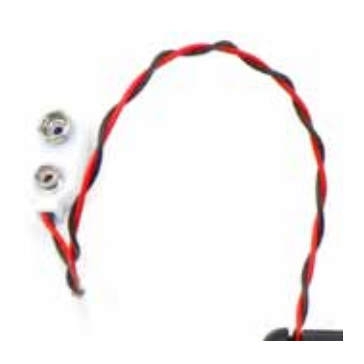
Figure 3 D